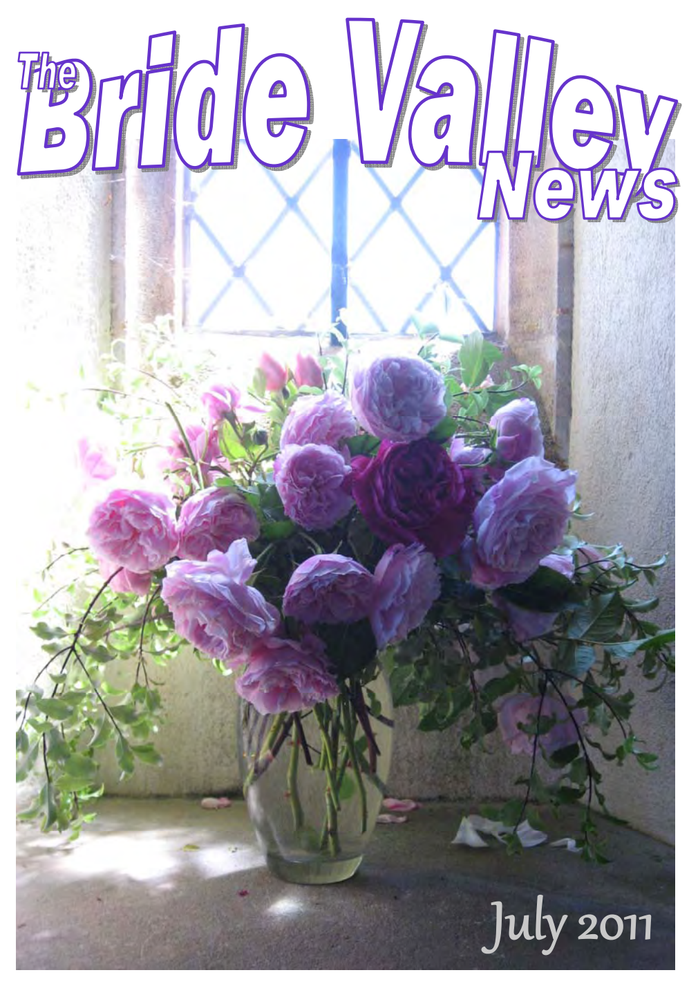
The Magazine of the Bride Valley Churches